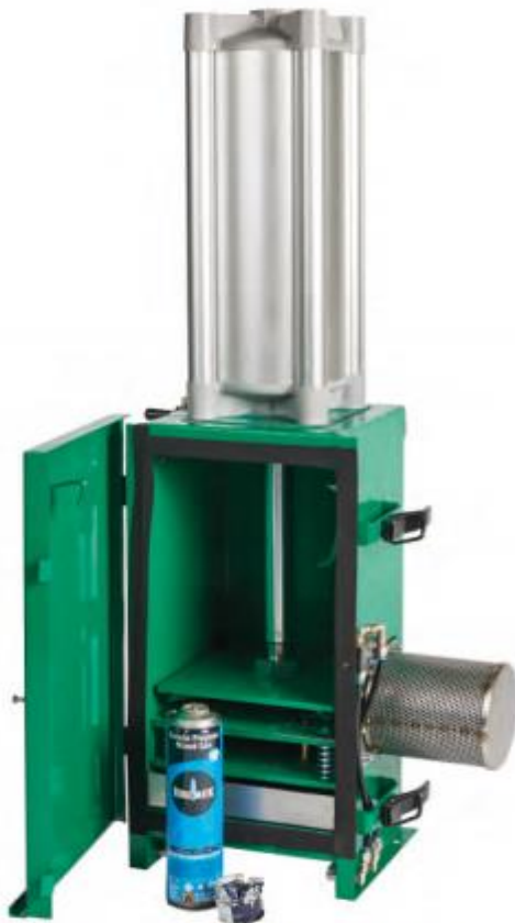
Recommended for empty cans